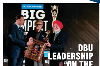
The DBU leadership received recognition from the Hon'ble Chief Minister of J&K, Omar Abdullah.