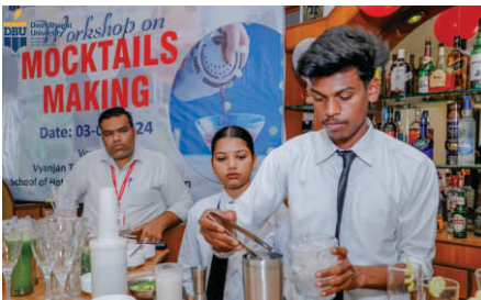
Mocktails Making Workshop