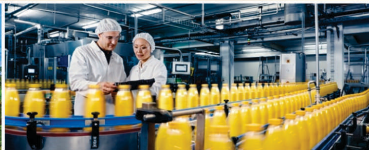
Food and Beverage Industry