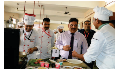
Budding Chef Competition