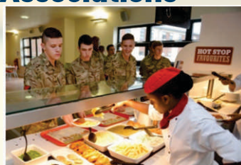
Hospitality service in Defence