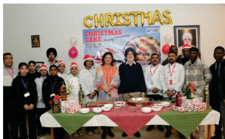
Christmas Cake Mixing Ceremony