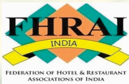
Hotel and Tourism Associations