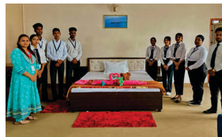
Workshop on Towel Art