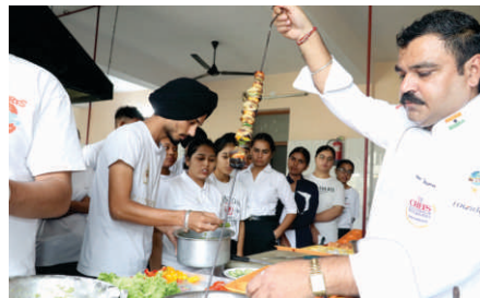
Workshop of Tandoor