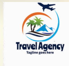
Tour and Travel Agency