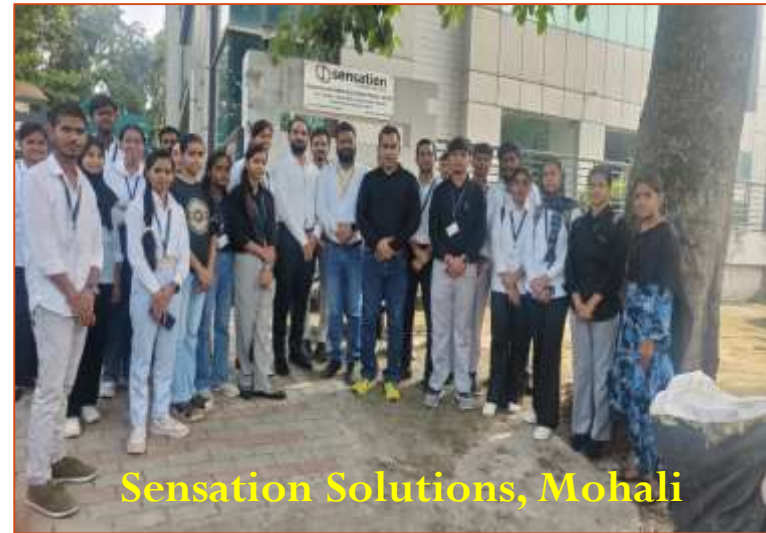
Sensation Solutions, Mohali