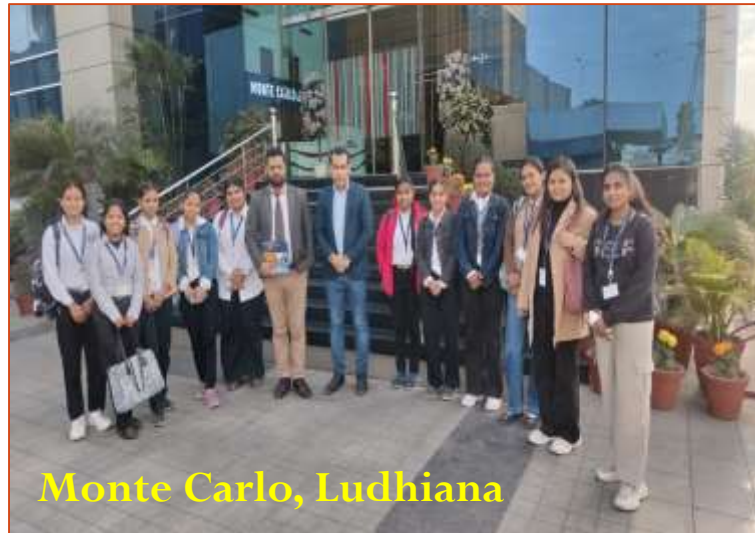
Monte Carlo, Ludhiana