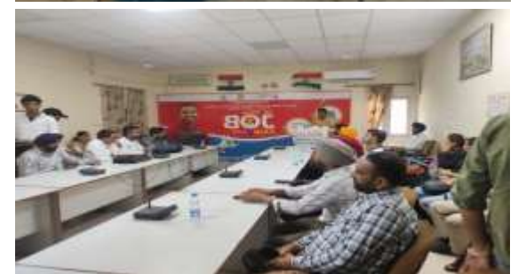
Students Registration During Job Fair Ribbon Cutting and HR Conference