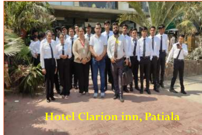
Hotel Clarion inn, Patiala