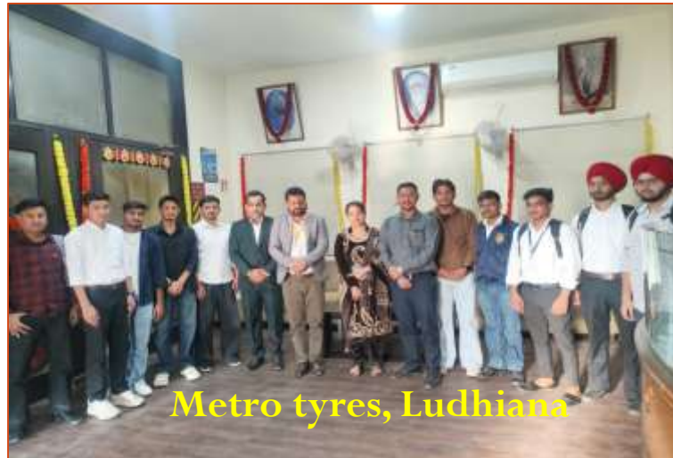
Metro tyres, Ludhiana