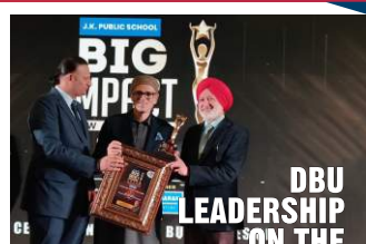
The DBU leadership received recognition from the Hon'ble Chief Minister of J&K, Omar Abdullah.