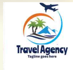
Tour and Travel Agency