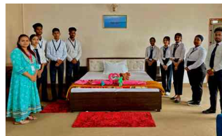
Workshop on Towel Art