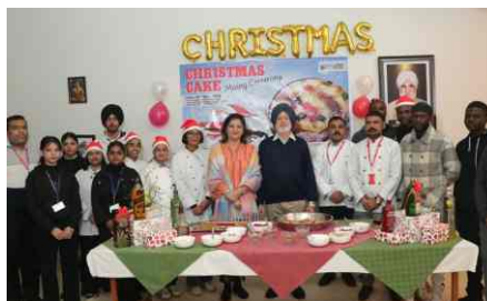
Christmas Cake Mixing Ceremony