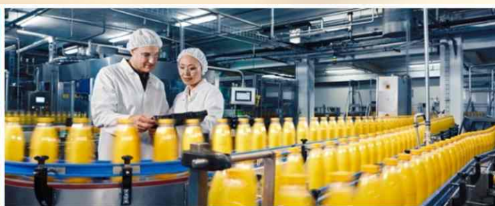
Food and Beverage Industry