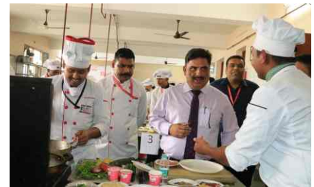
Budding Chef Competition