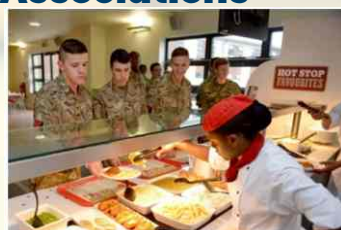
Hospitality service in Defence