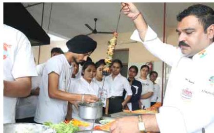
Workshop of Tandoor