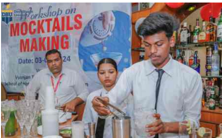
Mocktails Making Workshop