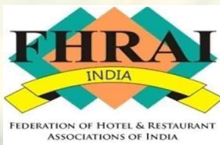
Hotel and Tourism Associations