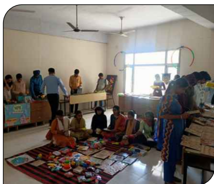
Arts & Craft Resource Centre