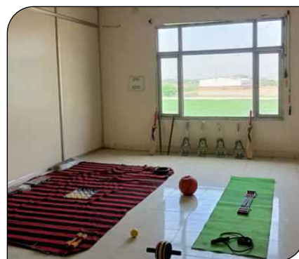
Health and Physical Education Resource Centre