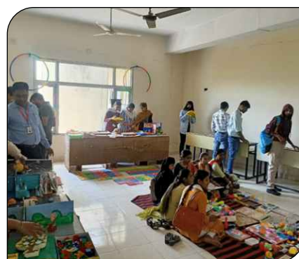
Arts & Craft Resource Centre