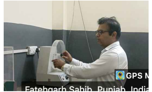
Quality Control Lab