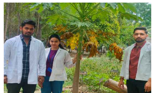
Herbal Garden (Vanaushadhi Udyan)