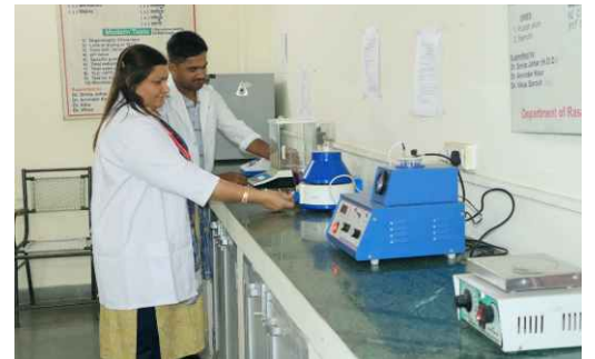
Central Research Lab