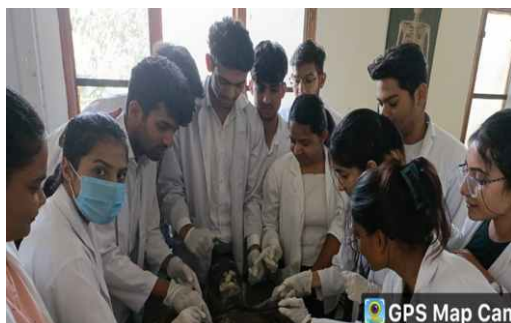
Anatomy Dissection Hall