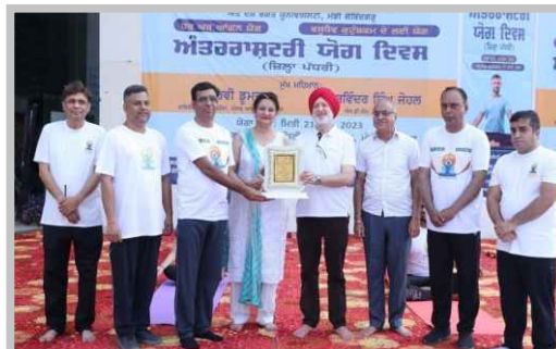
Celebration of International Yoga Day In collaboration with District Administration, Fatehgarh Sahib