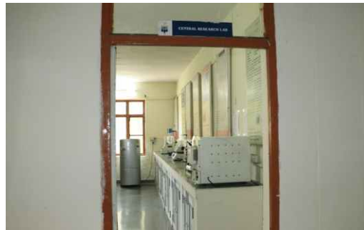
Central Research Lab