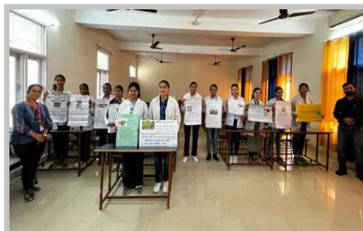
Herbs Placard Competition