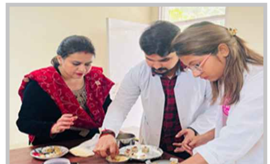
Ayurveda Chef Competition