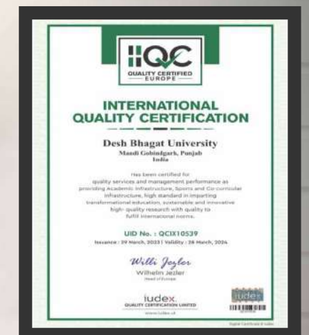
IIQC Recognition by index, UK