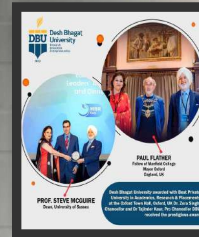
Best Private University in Academics, Research & Placements at the Oxford Town Hall, Oxford