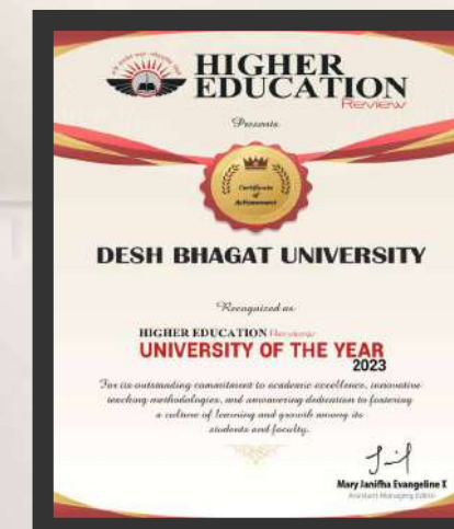
Higher Education Review recognized DBU for its outstanding commitment to academic excellence, innovative teaching practices and unwavering dedication to fostering culture and development among its students and faculty.