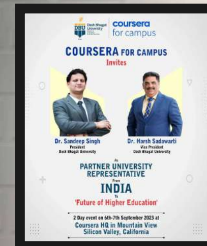
2 Day event on 6th-7th September 2023 at Coursera HQ in Mountain View Silicon Valley, California