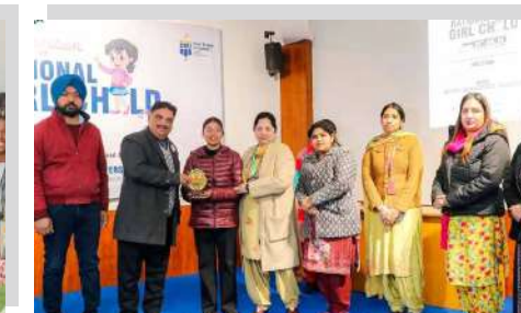
National Girl Child Day