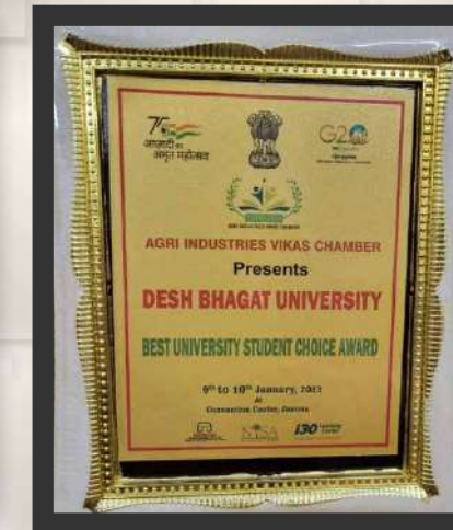
Best University Student Choice Award, Agri Industry Vikas Chamber