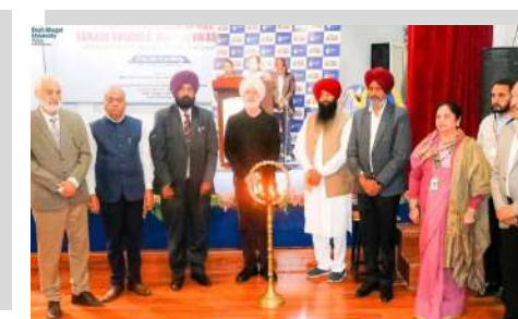
Progressive Farmers Day