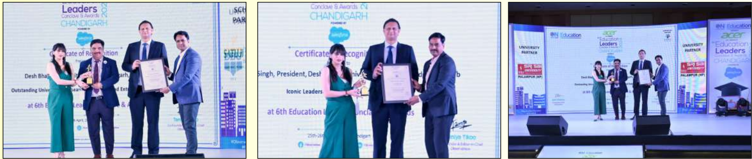
DBU honoured with Outstanding University in Research, Innovation and Entrepreneurship at 6th Education leaders conclave and awards