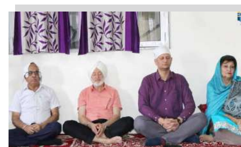
Beginning of session with Blessings of Almighty