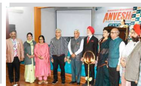
Anveshan (AIU Sponsored)