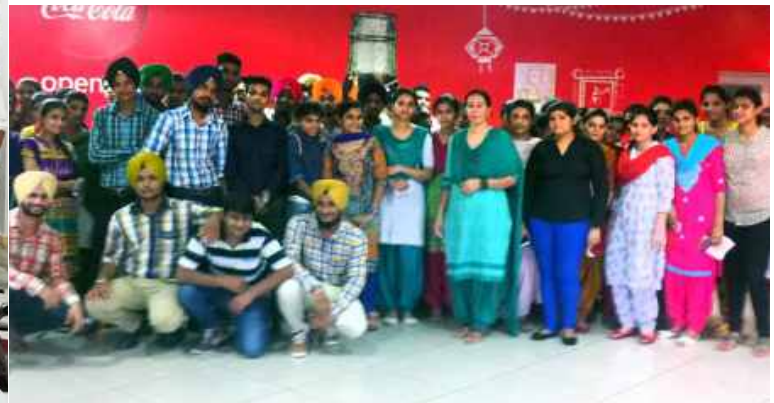
KANDHARI BEVERAGES NABIPUR, PUNJAB