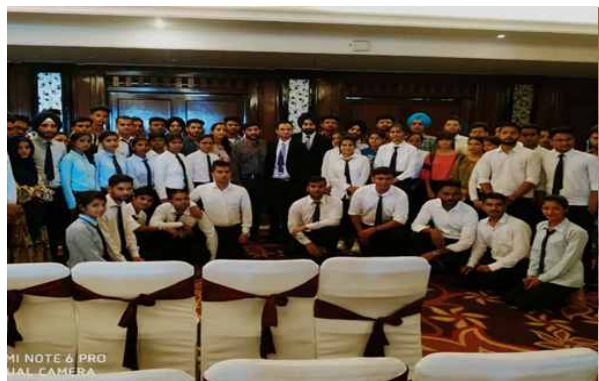
REJENTA KLASSIC, LUDHIANA