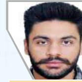
AMARINDER SINGH Equity Score