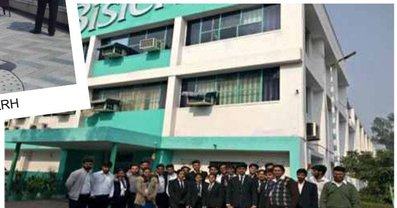
BISLERI , MOHALI