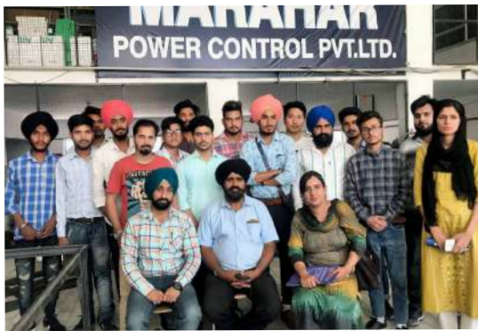
MARAHAAR POWER CONT. LTD, KAKARWAL, PUNJAB