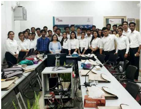
SUMITI PARALEGAL, CHANDIGARH