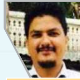
NAVNEET B.tech (CSE)