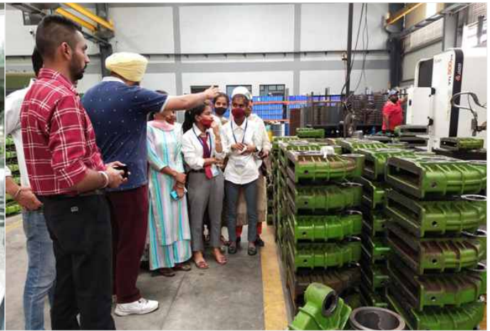
MALKIT AGRO TECH PRIVATE LIMITED NABHA, PUNJAB