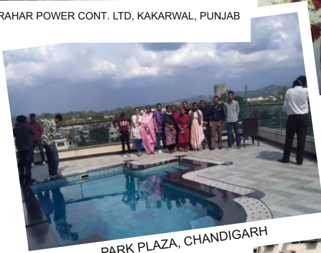
PARK PLAZA, CHANDIGARH