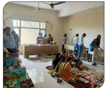
Arts & Craft Resource Centre