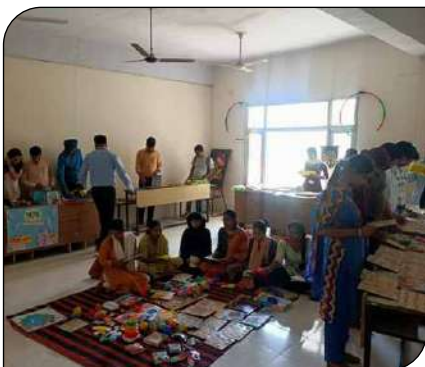
Arts & Craft Resource Centre