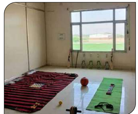
Health and Physical Education Resource Centre