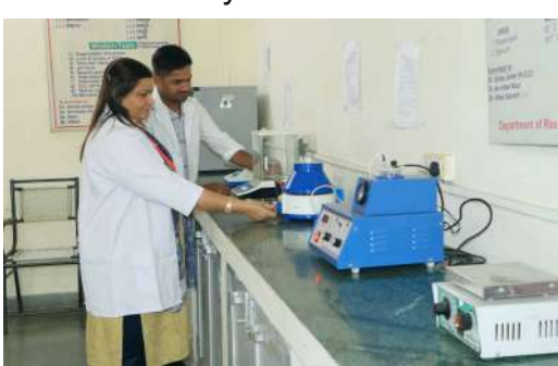
Central Research Lab