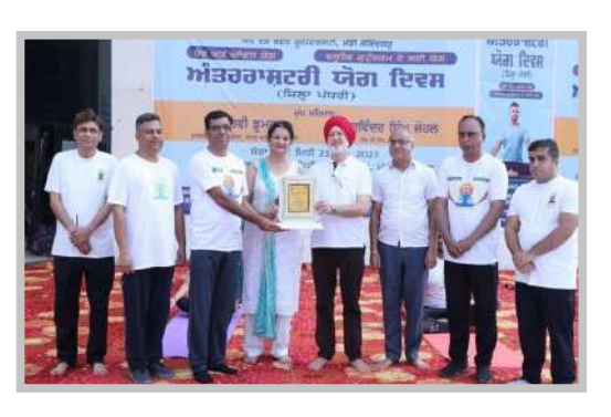
Celebration of International Yoga Day In collaboration with District Administration, Fatehgarh Sahib