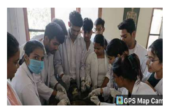
Anatomy Dissection Hall