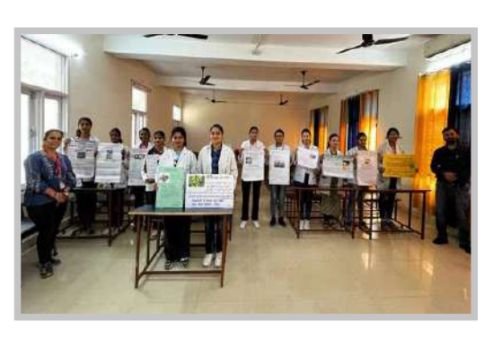
Herbs Placard Competition