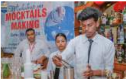
Mocktails Making Workshop