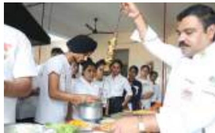
Workshop of Tandoor