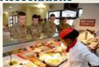
Hospitality service in Defence