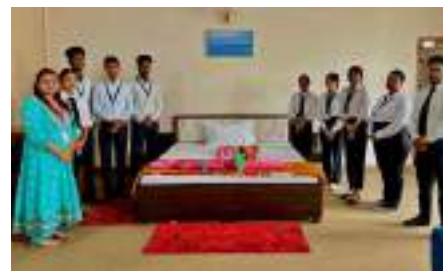
Workshop on Towel Art