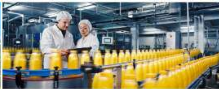
Food and Beverage Industry