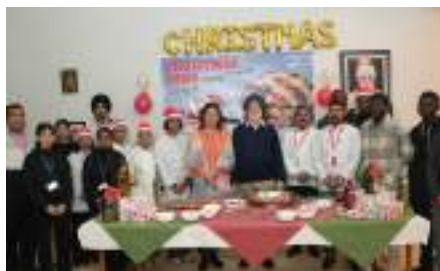
Christmas Cake Mixing Ceremony