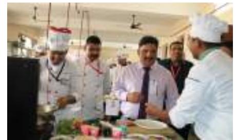
Budding Chef Competition