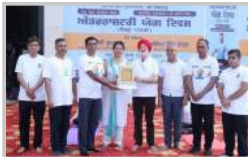
Celebration of International Yoga Day In collaboration with District Administration, Fatehgarh Sahib