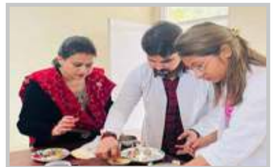
Ayurveda Chef Competition