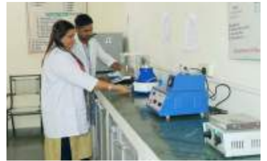
Central Research Lab