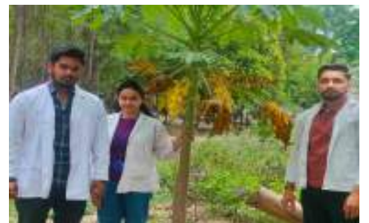
Herbal Garden (Vanaushadhi Udyan)