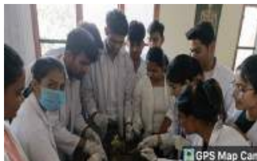
Anatomy Dissection Hall