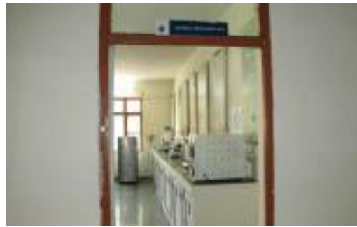
Central Research Lab