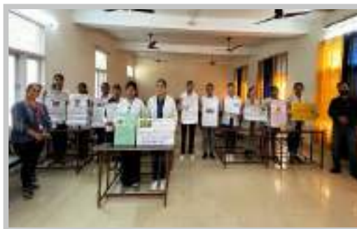
Herbs Placard Competition