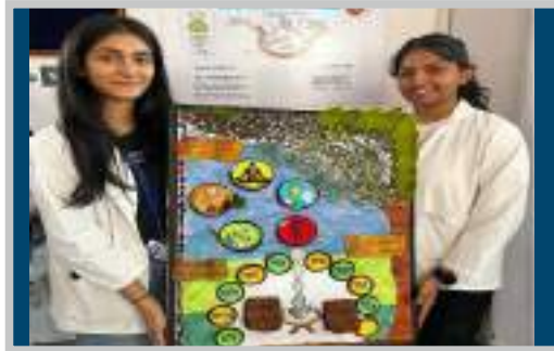
Poster Making Competition