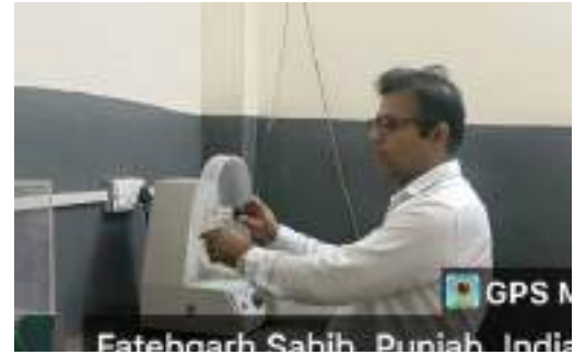
Quality Control Lab